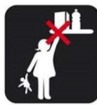
Keep away from children.