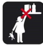
Keep away from children.